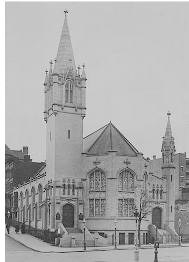
St. James moved several times before settling into its current location at 141st St and St. Nicholas Ave in 1927.