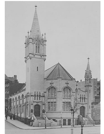
St. James moved several times before settling into its current location at 141st St and St. Nicholas Ave in 1927.