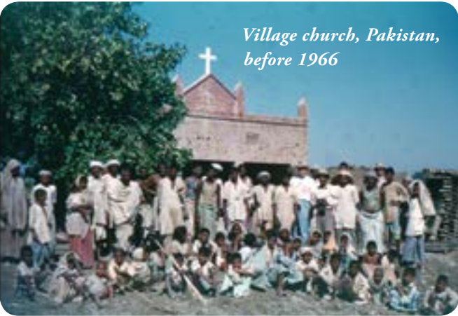
Village church, Pakistan, before 1966

In June 1967, a Nasir-led faction of Gujranwala faculty boycotted the synod meeting, believing the assembly-sanctioned Confession heterodox. Styling itself the true church, the group sued the synod in thirteen different jurisdictions for control of the Pakistani church.