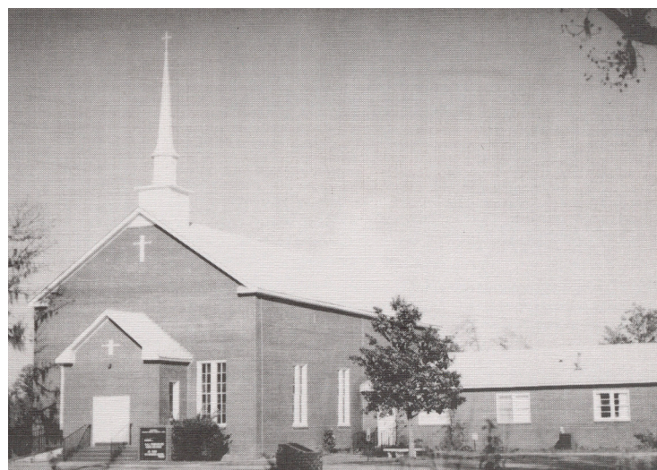
Goodwill Presbyterian Church, 1992.